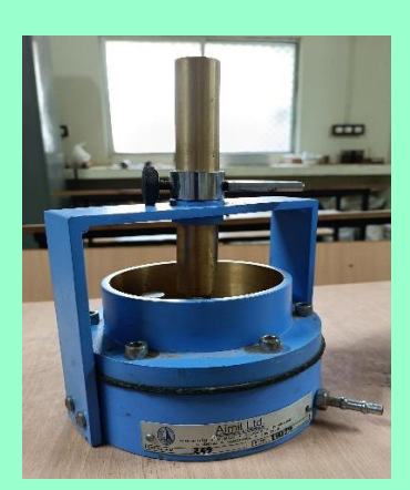
Geo-Synthetic Testing Apparatus